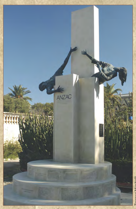
Two hundred and five names are inscribed on the plinth of the ANZAC Memorial

Zealand serviceman of the First World War who died and is buried in Malta.