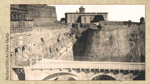
Valletta's original city gate (left) and the military gymnasium in the background — now site of the central bank

The tours also highlight points of interest on the islands - places where recovering servicemen and off duty personnel may have visited, and so can you.