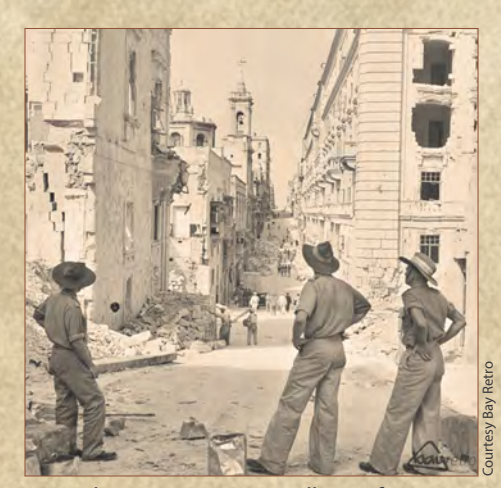
Australian servicemen in Valletta after an Axis air raid

* Make your way to Triq ir-Repubblika, retracing your steps past the Auberge de Castile, the statue of Grand Master de Valette and the renovated Pjazza Teatru Rjal - the original opera house was destroyed in 1942.