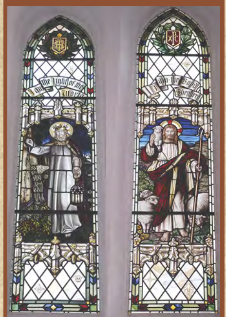
The window on the left depicts Christ as The Light of the World , after the painting by William Holman Hunt, whilst the other shows Our Lord as The Good Shepherd .

The stained glass windows were transferred to their present location in 1988.