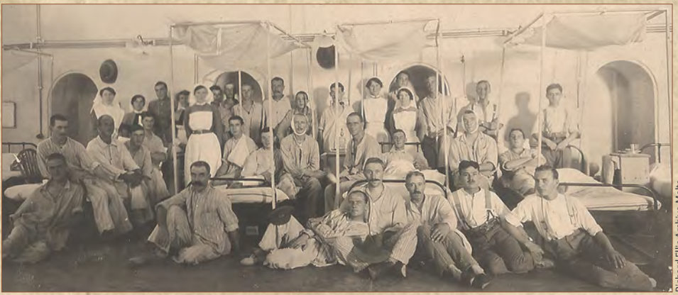
Recovering soldiers posing with nurses and 'medicos' at Valletta Hospital, that had "one of the biggest wards in the world"

available accommodation was taken up; each wounded was resting on his bed of comfort, where he was at once attended to by skilled medicos and devoted nurses."