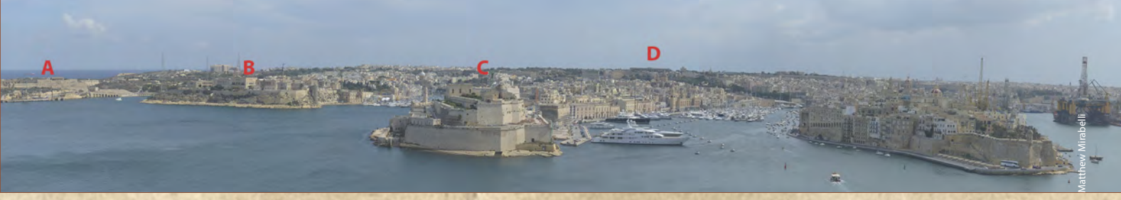
Valletta's Grand Harbour from the Upper Barrakka Gardens with: A - Ricasoli Hospital; B - Bighi Naval Hospital; C - Fort St Angelo, known as HMS Egmont in WWI; and, D - Cottonera Hospital

The many sick and wounded from Gallipoli required entertainment and the military gymnasium - built in 1872 for the Valletta and Floriana garrisons was turned into a soldiers and sailors institute. The Vernon United Services Club. as it became known, maintained its function is known as a as a social club for the military until 1967.