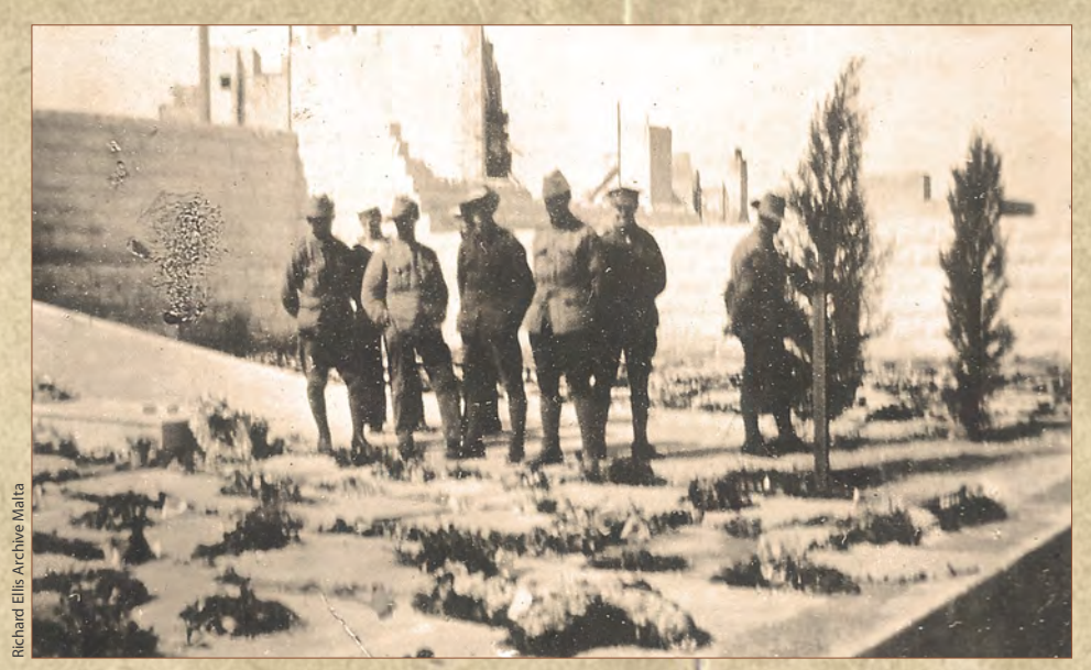
Anzacs paying their last respects to fallen comrades at the Pieta Military Cemetery

"Two qualities characterised the Australian soldier as a patient throughout the campaign. Under almost any suffering he was too proud to wince; and he struggled like a plant towards light and air and water. Stowed in the crowded, unventilated chambers of the ship any Australian who could move himself used to get somehow to the deck - and to the bath, if one could by any means be obtained."