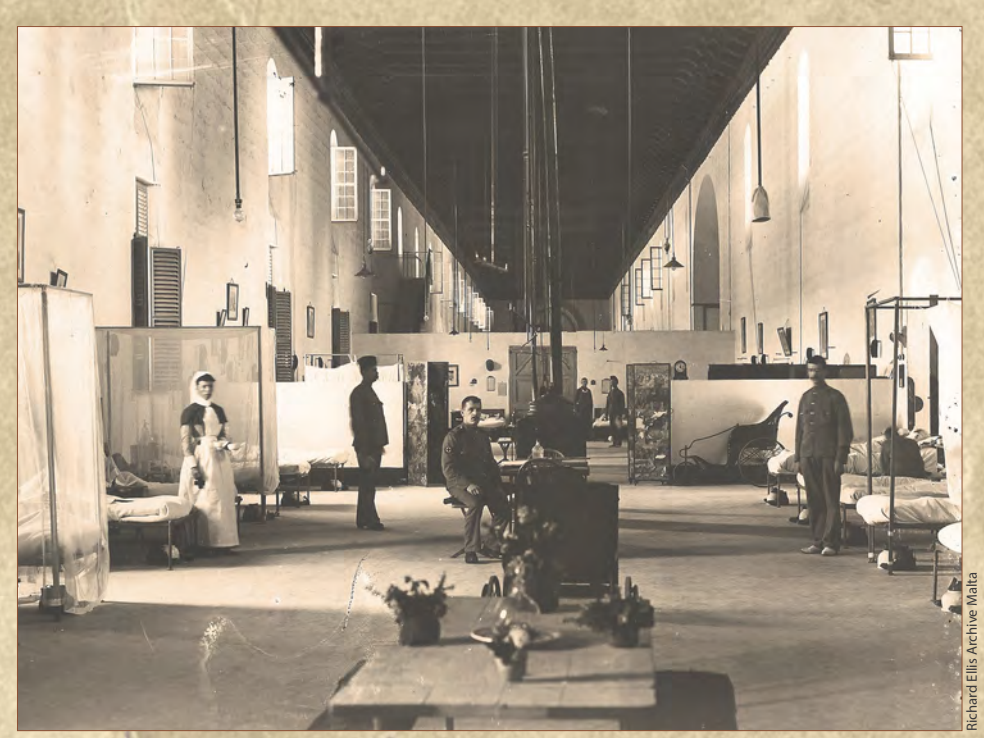
The Valletta Military Hospital, now the Mediterranean Conference Centre, was used expansively for triage and the treatment of the severely wounded

At the outbreak of the war Valletta Hospital had only 36 beds, but was increased to 440 just before the Gallipoli campaign with the renovation of disused wards and improvements made