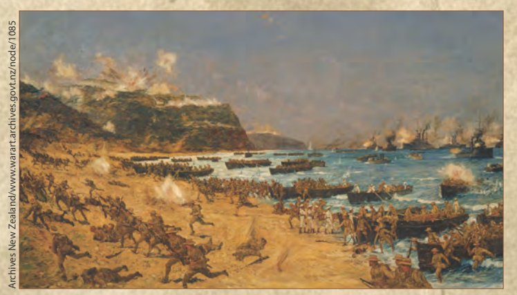
The landing at Anzac, 25 April, 1915, by Charles Dixon

At the start of the Gallipoli campaign, in April 1915, the wounded were evacuated to Egypt, but it was immediately evident that facilities there could not cope.