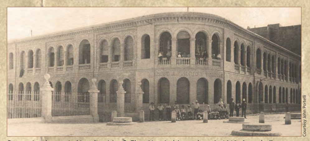
Recovering Anzacs 'taking the air' at St Elmo Hospital. It was here, in 1918, that a bullet was surgically removed from a trooper's heart - the first such operation in Malta

♣ Opposite the fort a government school was converted into the 218-bed St Elmo Hospital. Designated a surgical facility, it received its first patients on 12 August 1915, "but very soon more beds were needed and, by